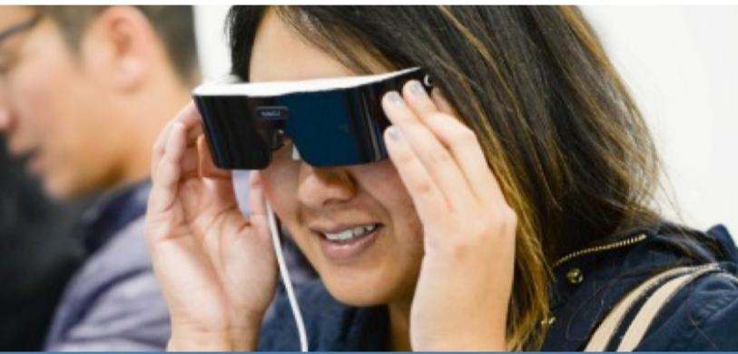
New AR/VR technology