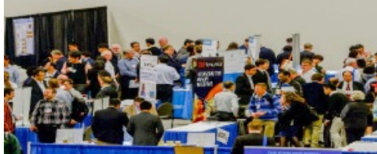
The I-Zone was one of the most popular exhibits at Display Week

One of Display Week's unique features is the Innovation Zone - where researchers and start-ups alike demonstrated prototypes of emerging products and technology, giving our attendees the chance to see best-in-class emerging display technologies in a dedicated area on the show floor.